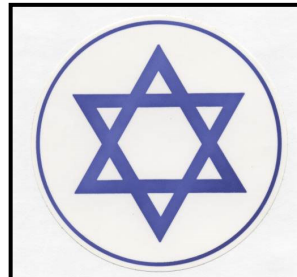
(3 ¾ inches)